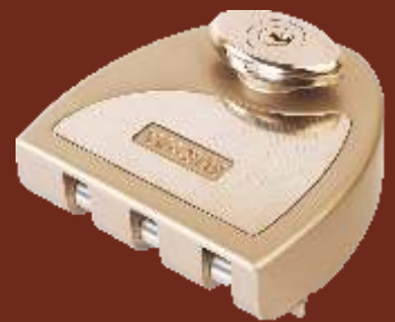
V621 Satin Nickel with DEAD BOLT