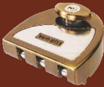
V621 Antique Brass with DEAD BOLT